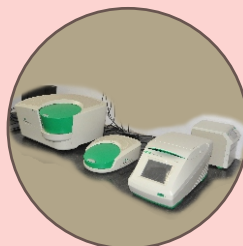
Droplet Digital PCR