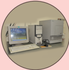
Real Time PCR