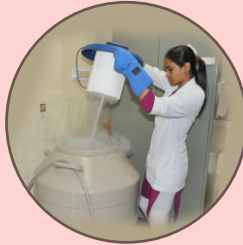
Liquid Nitrogen Storage